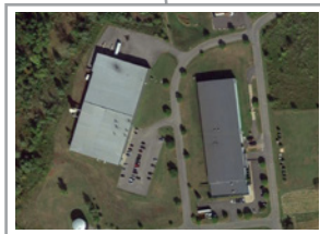
120 Business Park Drive, Frankfort, NY SF: 80,000