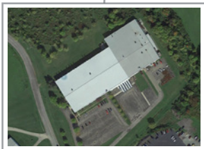
6823 Industrial Park Road, Bath, NY SF: 75,000