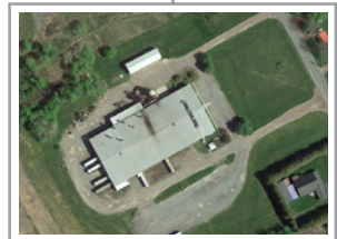
1159 County Route 24, Granville, NY SF: 50,000