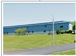
300 Broome Corporate Parkway, Conklin, NY SF: 65,000